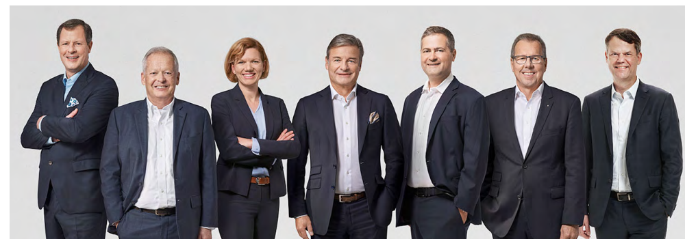
The Board of Directors of SFS Group AG

In discharging the members of the Board of Directors and the Group Executive Board, the company and the shareholders who are in agreement declare that they will no longer hold accountable those responsible for events in the preceding financial year that were brought to the attention of the General Meeting. The company is not aware of any facts that would oppose a full discharge of the members of the Board of Directors and the Group Executive Board.